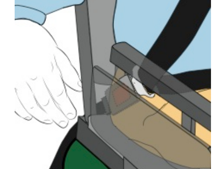
Lap belt threaded into opening between the wheelchair seat